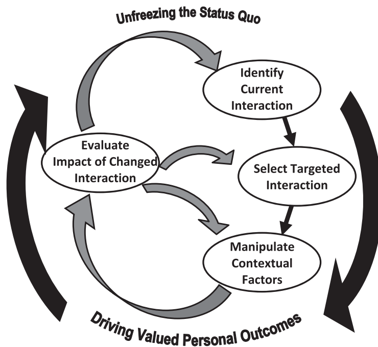
Figure 3. Context-based enhancement cycle.

The first step in applying the context-based enhancement cycle is to identify the key current interactions in the life of the person. These key current interactions are represented via the “dots” in Figure 1. Table 2 provides examples that highlight how current interactions that potentially impact personal outcomes can be identified, with specific focus on the outcome domains of self-determination and well-being. For example, as noted in Table 2, the interaction of supported decision-making legislation (macro) with supports for decision making (meso) with growth in decision skills (micro) will impact the degree to which self-